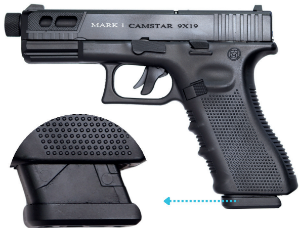
17 SHOT MAGAZINE