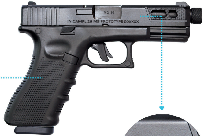
CERAMIC COATING CERTIFIED FOR EXTREME TEMPERATURE RESISTSNCE