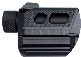
EASY SLIDER RACK GRIP