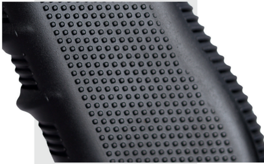
DEEP STIPLING FOR BETTER GRIP