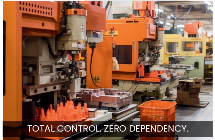
TOTAL CONTROL. ZERO DEPENDENCY.