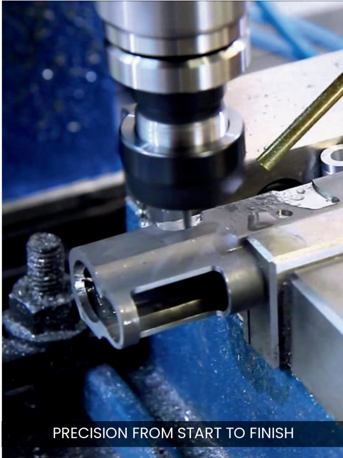
PRECISION FROM START TO FINISH